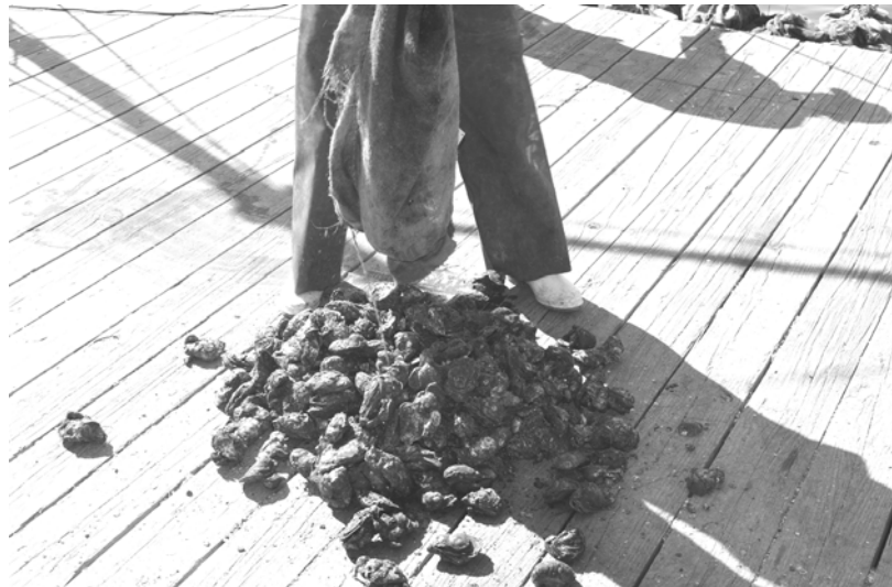
There are oysters a-plenty at the Pass Harbor. Photo by Ron Daley, 2009