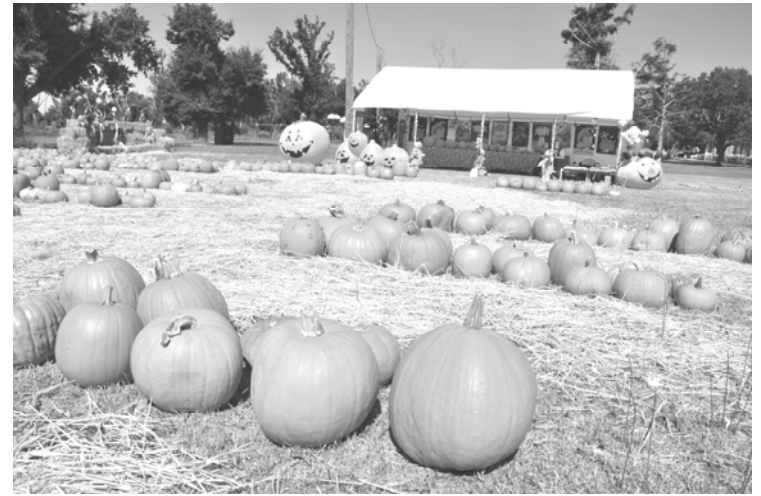
Pumpkins a-plenty await visitors at last year's Trinity Pumpkin Patch

Everyone is welcome to come browse among the pumpkins and take pictures. There are many "photo ops" that make a great addition to any album, so remember your camera. Bring the children in their costumes for a unique picture amid the pumpkins and the scarecrows.